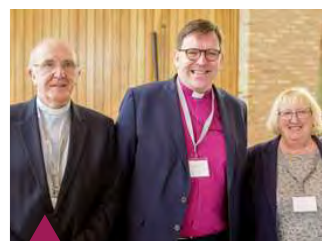
Moravian Elected as Chair for the Irish Council of Churches