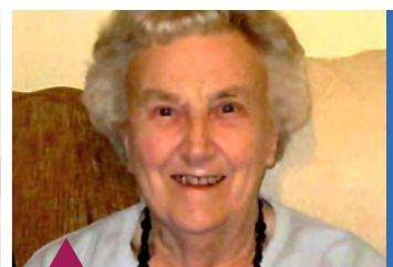
A trip to Unity Synod at Herrnhut in 1981