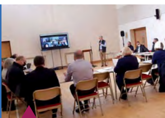
Gracehill World Heritage Conference