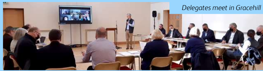
Delegates meet in Gracehill